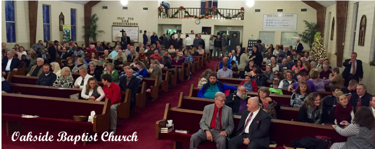
Oakside Baptist Church