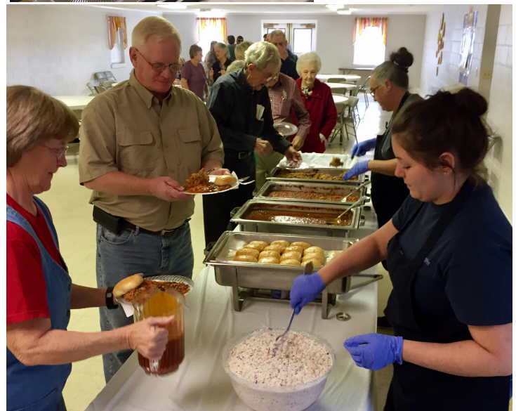
Above - Senior Adult Luncheon at East Vernon Baptist Catered & served by Sloppy Pig Catering of LaGrange