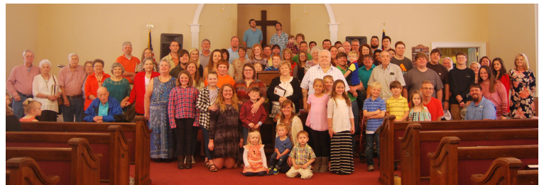
Mountville Baptist Church Congregation