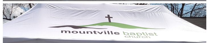
Shown above is a tent bearing Mountville's new logo. The logo is green and brown.