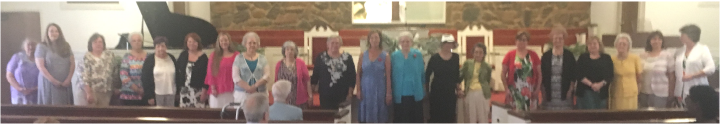
Above: Mother's Day Celebration at Dunson

Baptist Tabernacle(BTC) - Their church family is growing. Three people were added in May. "Praise God!" • The Food Closet gave away 345 boxes of food and 434 meals were distributed serving 557 individuals. Fifteen children were given 60 backpacks for weekend food. • The Clothes Closet served 133 people. God continues to bless both of these ministries. • On Mother's Day, BTC honored the mothers during the worship service and gave out devotional books with pens entitled "Woman of God: Living Loved". • Awanas had Chocolate Waterslide Night on May 10. They spend the night outside playing on the chocolate waterslide. This event was enjoyed by leaders and children. On May 17, the Awanas Ceremony was held with children receiving awards followed by an ice cream social afterwards. • Graduates of BTC were honored on May 28 during morning worship service. The graduates for 2017 are: