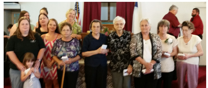
Creekside Mother's Day Celebration (above & below)