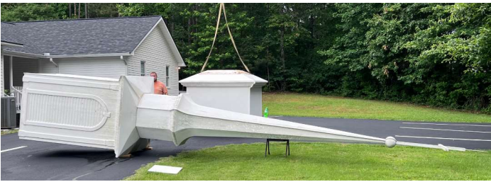
Lakeview had their church steeple removed, repaired and replaced.