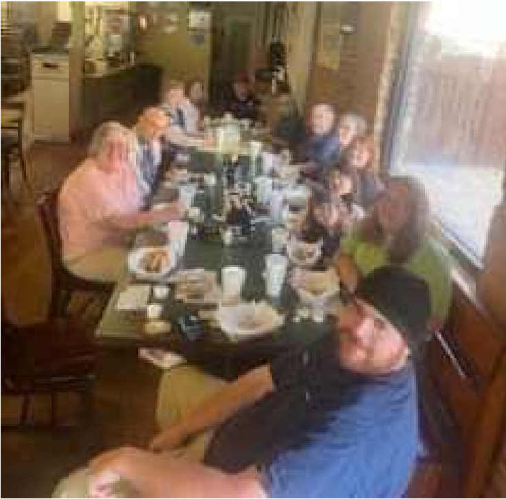
Dunson: Following the KIA tour, the group ate at Pokey's Restaurant in West Point