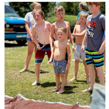
Above: Long Cane VBS: The Prodigal Son characters and water slide fun.