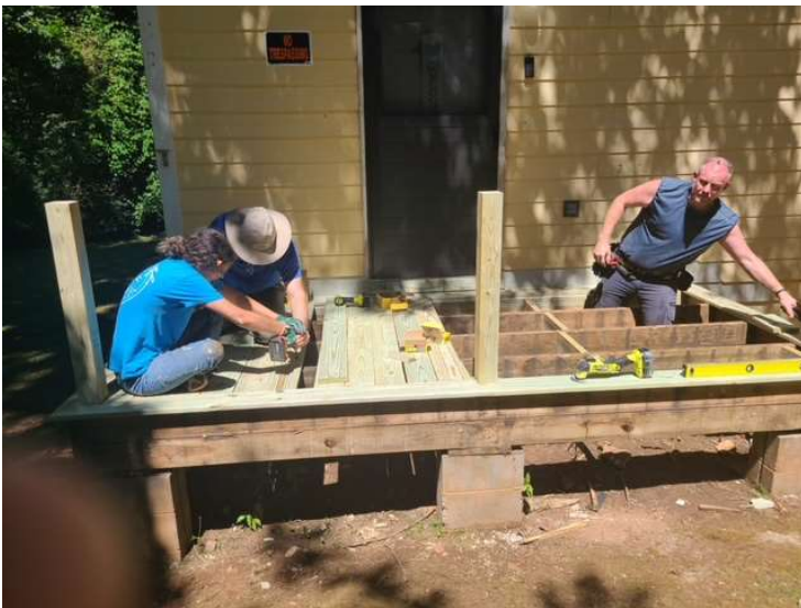
Dunson: 3 photos above and right

Dunson sponsored a Mission Serve Team June 24-28. Their team of 10 youth are from LaGrange, Tennessee, and South Carolina. Dunson and East LaGrange members served them lunch daily at their job site.