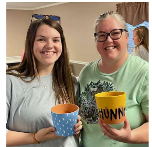
Above Right: Reeds Chapel's WMU painted flower pots.