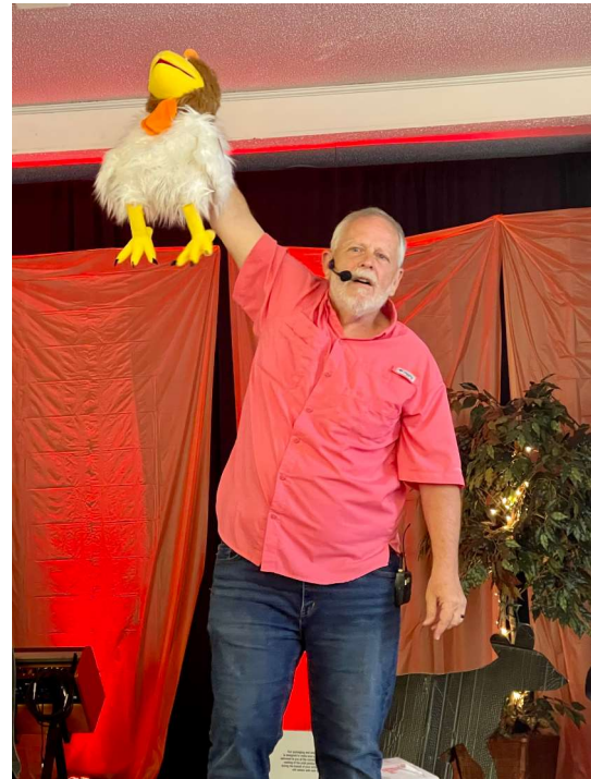
Reeds Chapel: Scenes from VBS