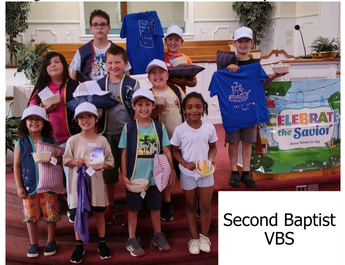
Second Baptist VBS