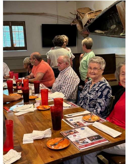
Grace: Sunday School Class outing to Ezell's in Columbus