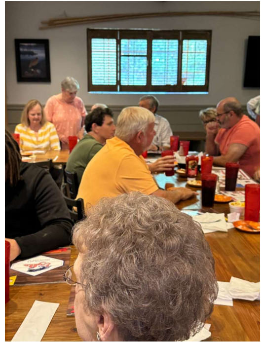
Grace: Sunday School Class outing to Ezell's in Columbus