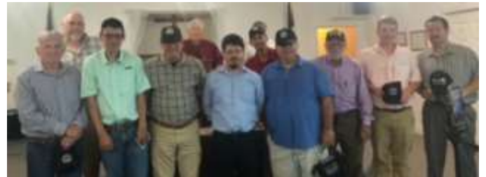
Above: Creekside's Men on Father's Day.