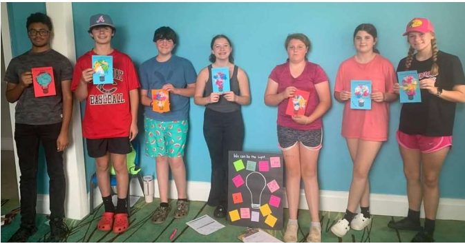
FBC Hogansville Youth have painted their youth room this summer. They are also helping with the Green Patch Backyard Bible Club and will help with VBS in July.

Grace Baptist - served 166 people with free food in June. Free food is available every 3rd Saturday. The drive through starts at 9:00 am.