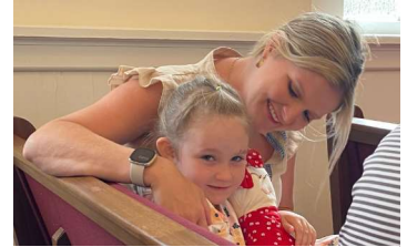
Children in church are a blessing!

Long Cane - held Vacation Bible School on June 8. The adults performed a play based on the Prodigal Son for the students. The day ended with a water slide and Kona Ice.