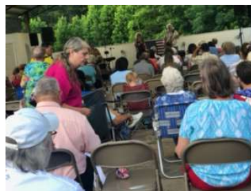
At left: There was a good crowd for the singing on June 22 at the Laddie Yates Pavilion.