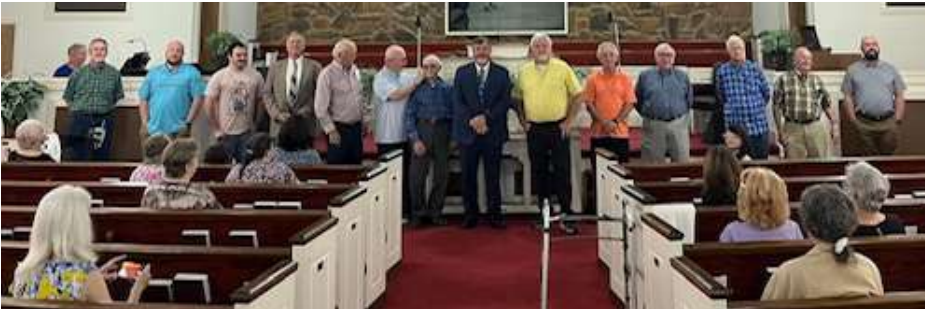
Father's Day at Dunson Baptist Church