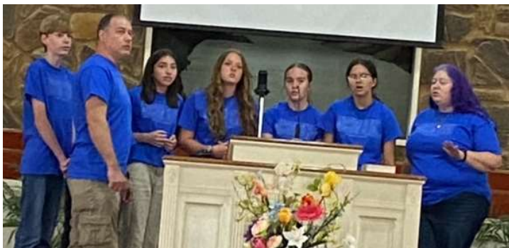
Top: Dunson's Mission Serve Team singing during morning worship.