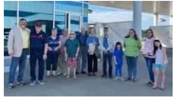
Dunson: Field Trip & Tour of the KIA Plant