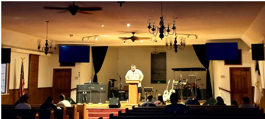
Reeds Chapel: Youth Lock-In