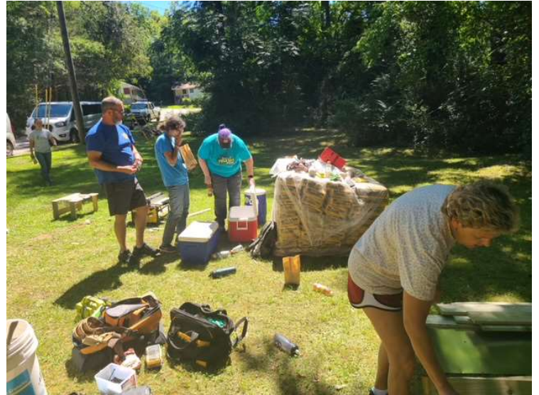
Dunson / East LaGrange Mission Serve