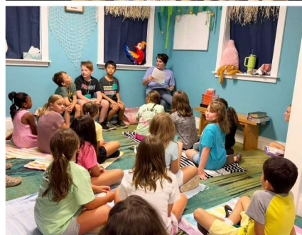
First Baptist Hogansville Vacation Bible School Below: Donation to God's Bread Basket