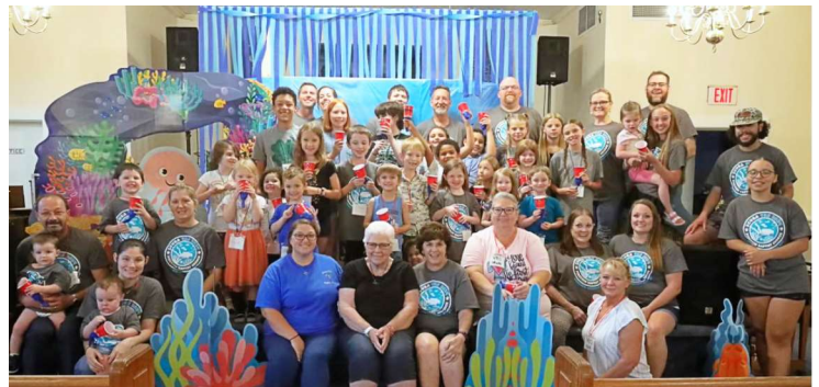
Above: Pine View's Vacation Bible School Children & Workers