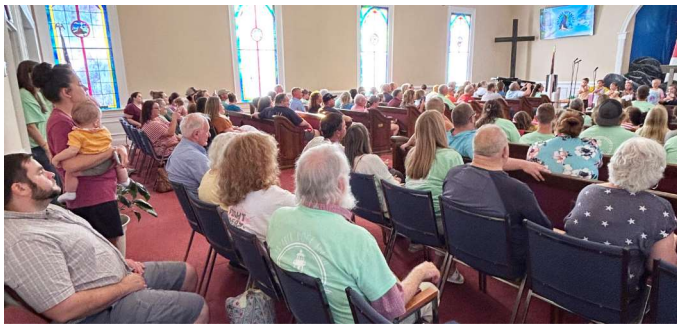
Above: Mountville VBS Right: Ice Cream Truck paid a visit to VBS