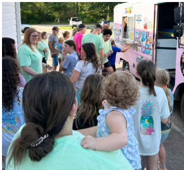
Below: Mountville sponsored a Mission Serve Team from Port St. Lucie, Florida