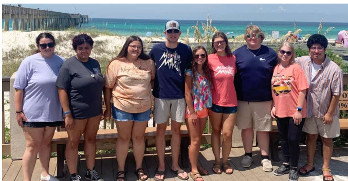
Above: Mountville Impact Team enjoyed a beach trip in July.

Pine View - completed their VBS on Saturday, July 20 th . They had a great turnout with 27 children in attendance over the 3-day event. "Our amazing staff did a fantastic job with Bible Stories, Games, Crafts, Music, and Meal Prep." The bounce house was scheduled to close out the week, but due to the unsettled weather, it has been rescheduled for August 10 th . "We are very hopeful that all the children will be back to join us for lots of fun, and of course, we'll have a fellowship meal to accompany the celebration."