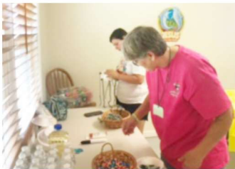
Above: Scenes from Creekside's VBS on July 6 th .