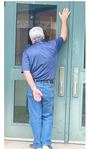
Above: Grace BC members praying at Long Cane Elementary and Middle School