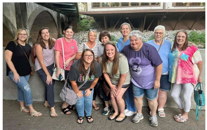
Above: Pine View ladies enjoyed a trip to Helen, Ga.

If you have a friend, relative or fellow church member who does not receive The Messenger, encourage them to call us at 706-884-1975 and have their name added to our mailing list. If you would prefer getting The Messenger by email (in color) instead of US Mail, please call us and provide your email address. You may also visit our website www.troubaptist.org/newsletter and go to subscription preferences to add change or remove your address from our mailing list.