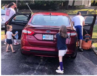
FBC Above: FBC Ladies attended the Priscilla Shirer Simulcast in Rock Springs. On Left: Celebrate Recovery Car Wash Below: The church sponsored a block party in the Corinth area.